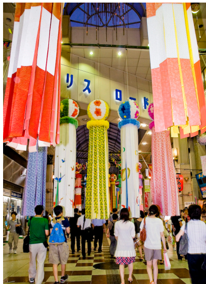
Tanabata Festival: Sendai

We'll also have our AGM where policy and business discussions take place. There will be some changes in the MW-SIG Executive board. This is your chance to get on board the MW-SIG team to help out and be involved in the decision making at this exciting time. We really need volunteers, i.e. YOU, to come forward to help with the smooth running of our SIG. Without that base, our more inspiring plans simply won't take off. We need you. ✕