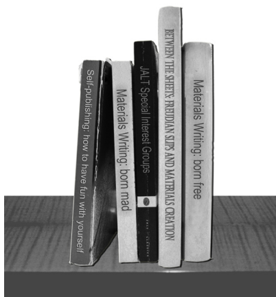
MATERIALS WRITERS SIG: MORE THAN YOU ASKED FOR