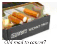
Old road to cancer?