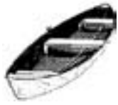
Figure 2: The Lifeboat

A cruise ship, "The Golden Bird" has sunk! There are eight survivors. The survivors are in a small lifeboat. The lifeboat can only safely hold six people! You must choose two survivors to leave the boat! Please choose from the eight people described below.